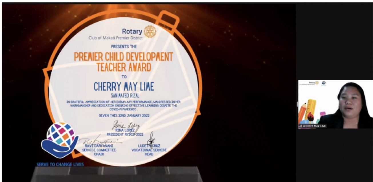
Awards for Premier English Teacher, HS Science, and Early Child Development were awarded

We congratulate all nominees, especially the winners and look forward to our next batch of Premier Teacher Awardees next year. Mabuhay ang mga guro, ang ating mga bayani!